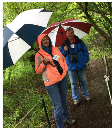
Inclement weather did not deter birders at the Spring Gathering.