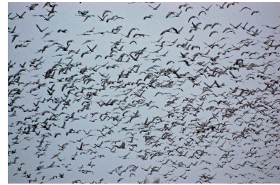
More than 15,000 cranes put on a dazzling show for 13 lucky KCA members during a trip to Nebraska in March.